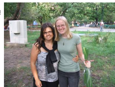
Right: Happy Birthday in Bucharest!

leaders, we would focus on supporting the church in becoming the change in the community. In this way, the church really becomes the light shining the love of Christ into the community, transforming lives both inside and outside of the church. We believe that it is important to continue with the work that has started, and we have a passion for this work, given by God!